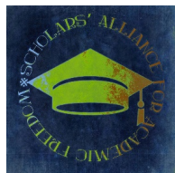
Scholars' Alliance for Academic Freedom 學術自由學者聯盟